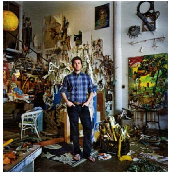
ART: ELLIOTT HUNDLEY