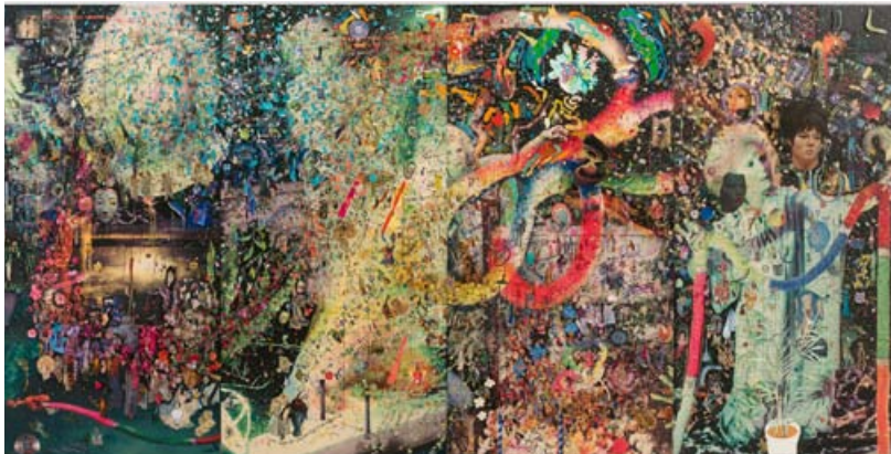
Elliott Hundley: Agave , 2010, wood, photographs, pins and mixed mediums, 96 by 192 1/2 by 14 1/2 inches; at Andrea Rosen.