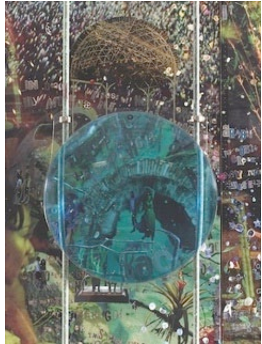
Elliott Hundley, The Lightning's Bride (detail), 2011 six panels, wood, sound board, ink-jet print, on Kitakata paper, pins, paper, plastic, magnifying lenses, metal, photographs, wire, found paintings, 8' 3" x 24' 1 1/4" x 1' 7".