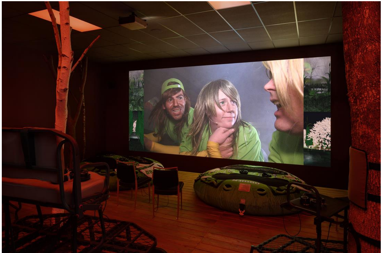
Installation view of Lake Anticipation (2016). Photo by Pierre Le Hors. © Lizzie Fitch / Ryan Trecartin. Courtesy of Andrea Rosen Gallery.

At the temple, Fitch, Trecartin, and dozens of collaborators crowded into the building with GoPros, Handycams, DSLRs, drones, tripods—more or less every contemporary video capture technology available. Each person took on new and old vestiges of the artists' ever-evolving, slippery characters; clad in shoddy costumes, wigs, and beauty products, they faced off against each other, wielding these different recording technologies. The plot they build is challenging, often slipping off into tangents and introducing new personalities. The acting is energetic, as individuals slide between roles constantly, destabilizing any sense of a fixed cast of characters. It almost feels as though the actors are trying to change faster than capture devices can record them.