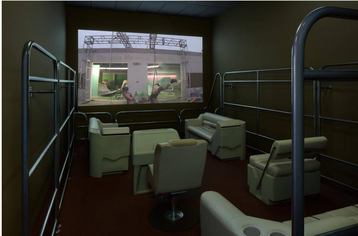
Installation view of Stunt Tank (2016). Photo by Pierre Le Hors. © Lizzie Fitch / Ryan Trecartin. Courtesy of Andrea Rosen Gallery.

onscreen into the gallery. The largest room contains a broad wooden deck pierced by a few stray trees and laden with hunting equipment. The setup evokes both the predatory and the voyeuristic aspects of surveillance, while multiple feeds of video play on an enormous projected screen. An adjacent room offers a nautical setting, locating viewers on padded seating pulled from a pontoon boat (some seats even retain their cupholders). The environment emphasizes the ways in which we are simultaneously captive to media and transported by it—the way media can act as a vehicle that brings us into alternate realities. All four sculptural theaters present similar (though differently executed) arguments about our relationships to media.