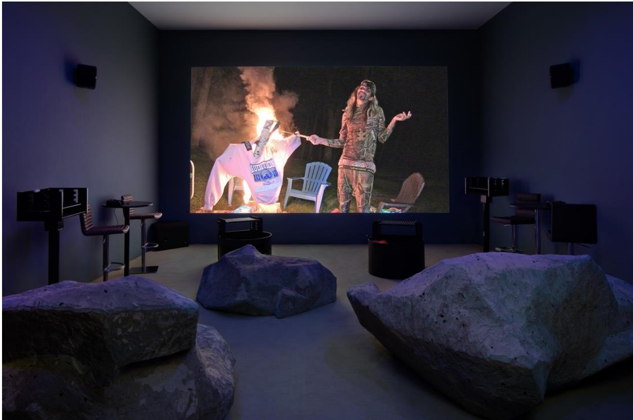
Installation view of Retreatery Butte (2016).